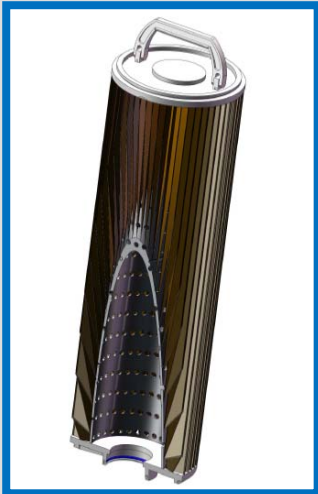
Install MAX-OUT Cartridge