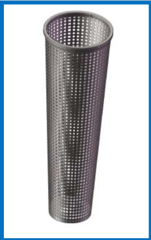
Remove Existing Basket